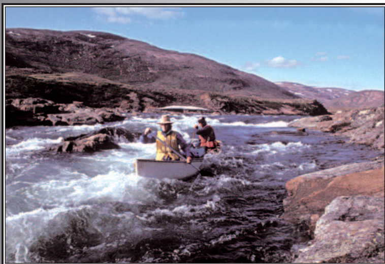
CLASS II WHITEWATER

Access is via twin-engine Otter , equipped with "tundra tires"; landing directly adjacent to the river. The climate is surprisingly dry, and there are no black flies . The pace is fairly relaxed, allowing ample time for some spectacular side hikes , and excellent Arctic Char fishing .